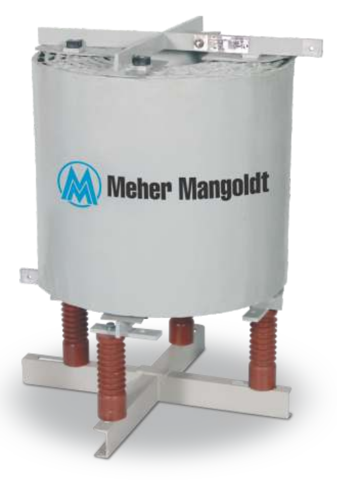
Filter Air Core Reactor