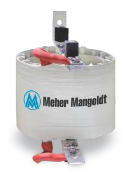
Damping Air Core Reactor

MEHER Group's deep involvement in the field of MV and HV reactive power compensation on turn-key basis gave a natural impetus to the inhouse development of air-cored reactors. Several deliveries made over the years have stood the test of time, thanks to the exacting demands of discerning users.