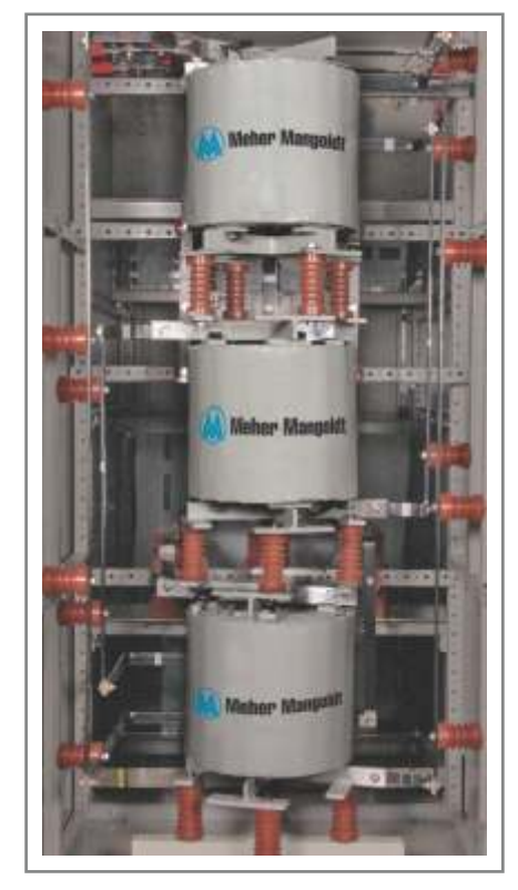
Three single phase reactors assembled in a cubicle in vertically stacked arrangement